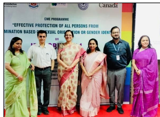
Program on protection against discrimination based on gender orientation, 17 th May 2024