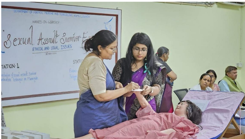
Sexual assault survivor hands on workshop, Deptt. of Forensic Medicine