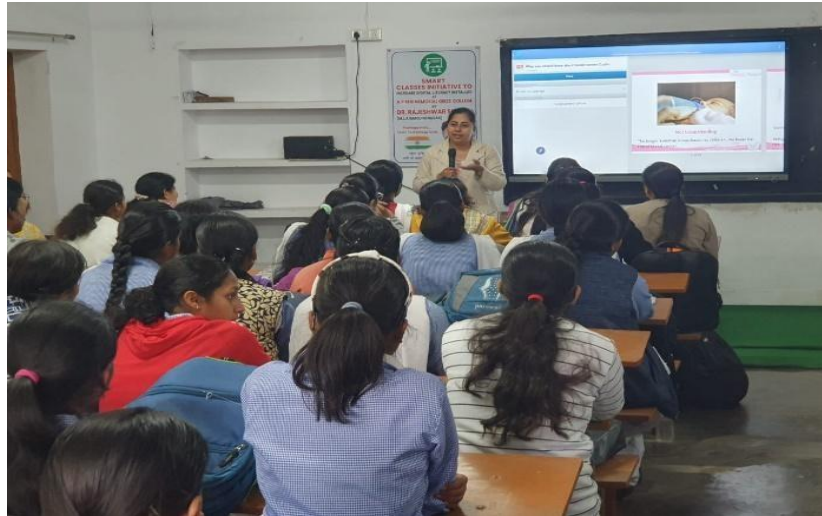
Program on awareness of Breast and Cervical Cancer, 4 th April, 2024