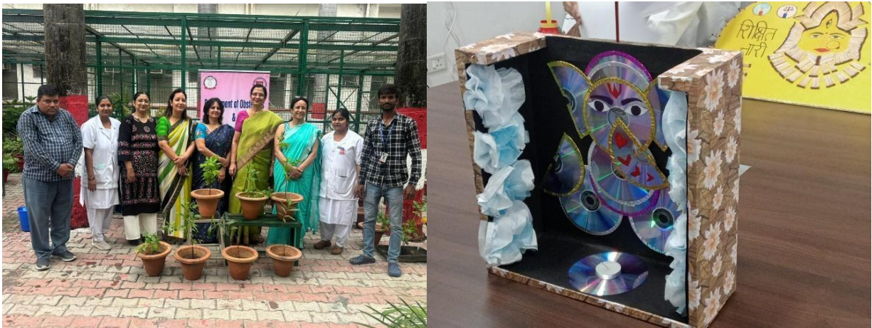
Tree plantation drive, 7 th June 2024 and Best out of waste activity