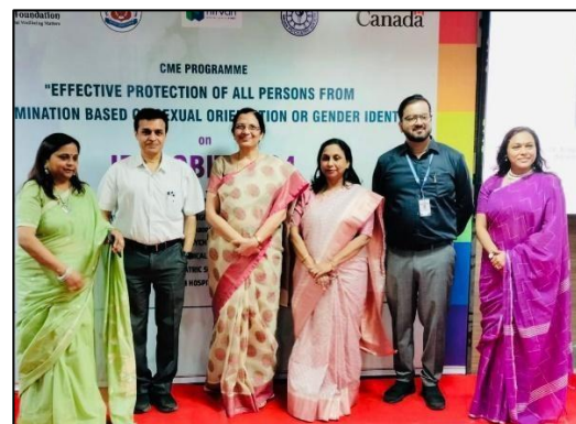
Program on protection against discrimination based on gender orientation, 17 th May 2024