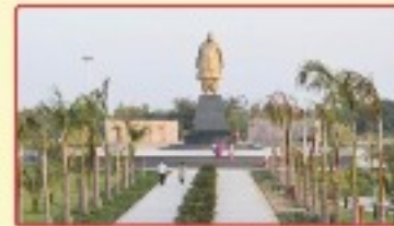
Janeshwar Mishr Park