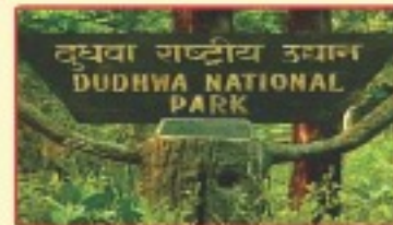
Dudhwa National Park