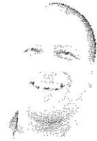
Yogi Adityanath Chief Minister, U.P