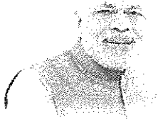
Narendra Modi Prime Minister